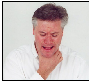
Figure 3: Universal choking sign

Airway obstruction will cause the diaphragm muscle to work harder to achieve adequate ventilations. The abdomen will continue to move out but there will be loss of the natural rise of the chest (paradoxical movement), and in-drawing of the spaces between the ribs and above the collar bones during inspiration.