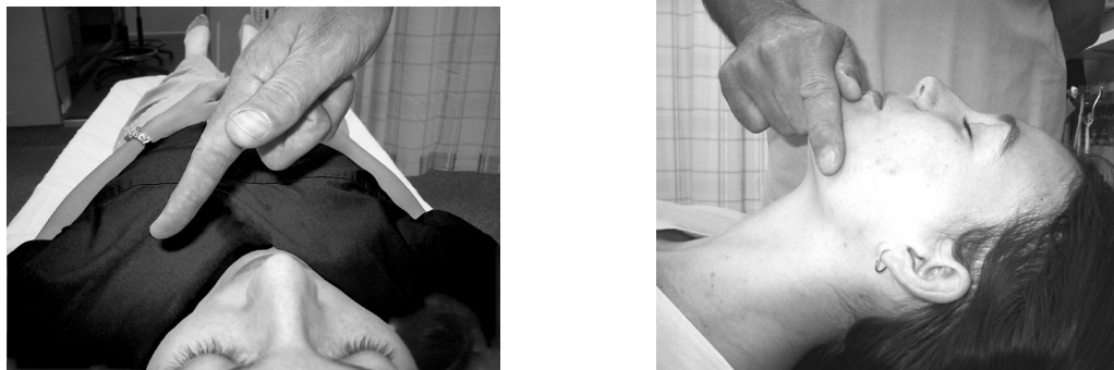
Figure 1: Head tilt/chin lift manoeuvre

Chin lift is commonly used in conjunction with Backward Head Tilt. The chin is held up by the rescuer's thumb and fingers in order to open the mouth and pull the tongue and soft tissues away from the back of the throat.